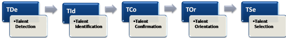
Figure 2: Principle model of Talent Recognition